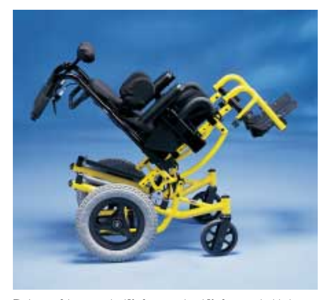
The Invacare Solara jr. provides 45^{\circ} of posterior tilt and 5^{\circ} of anterior tilt while the center of gravity remains virtually stationary, providing comfort and improving the consumer's visual field.